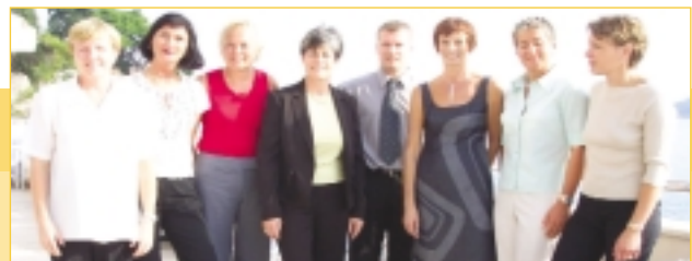
EWS members in Dubrovnik

associate member status at the ESC Executive Committee and it is stipulated that ESC countries are expected to include EWS contact persons in their national delegations or to facilitate, in another way, their participation at the European Sports Conference, as well. This is not respected and some European countries did not dare to respect equality during the EWS Open Meeting. Some countries sent several men to Dubrovnik and did not send the EWS person contact.